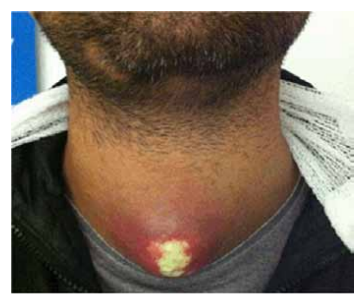
Figure 2: A clinical photograph showing a midline discharging abscess arising from the thyroid gland with discoloration and necrosis of surrounding skin.