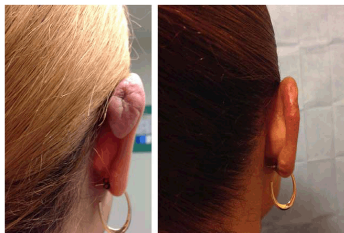
Figure 2: (Before, Left) A 29-year-old Hispanic female with a 2 cmx3 cm right posterior ear keloid who underwent extralesional excision followed-by three fractions of superficial photon X-ray radiation therapy for a cumulative dose of 18 Gy. (After, Right) Six months following the procedure and demonstrates no evidence of recurrence or hyperpigmentation.