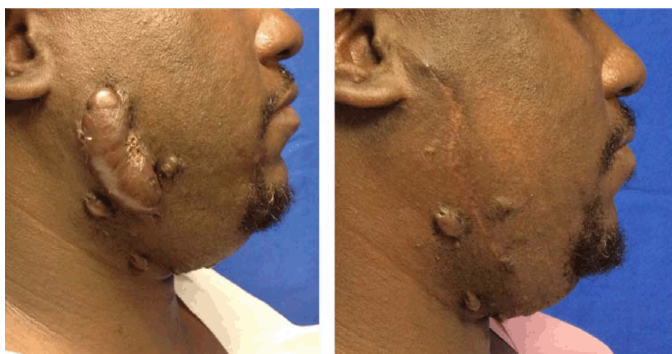
Figure 3: (Before, Left) A 38-year-old African American male with a 15 cmx5 cm right facial keloid who underwent extralesional excision followed-by three fractions of superficial photon X-ray radiation therapy for a cumulative dose of 18 Gy. (After, Right) Eight months following the procedure and demonstrates no evidence of recurrence or hyperpigmentation. Satellite lesions will be excised during a second procedure.